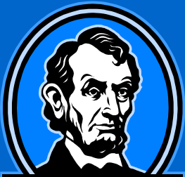
ABRAHAM LINCOLN The 16th U.S. President 1861-1865