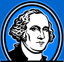
GEORGE WASHINGTON The 1st U.S. President 1789-1797