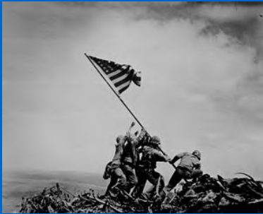
Raising the Flag at Iwo Jima